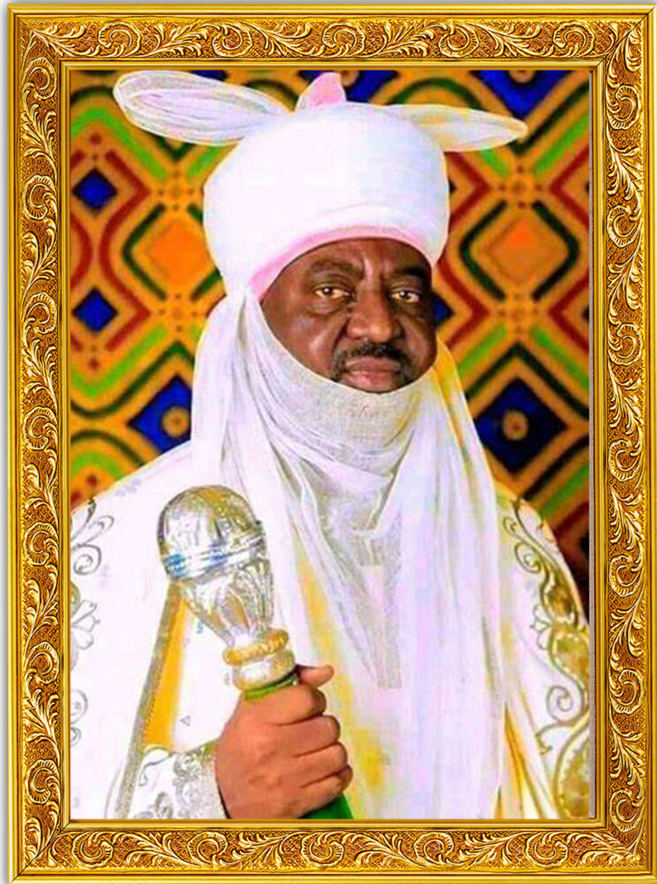
Royal Father of the Day Alh. Dr. Aminu Ado Bayero, CFR Sarkin Kano