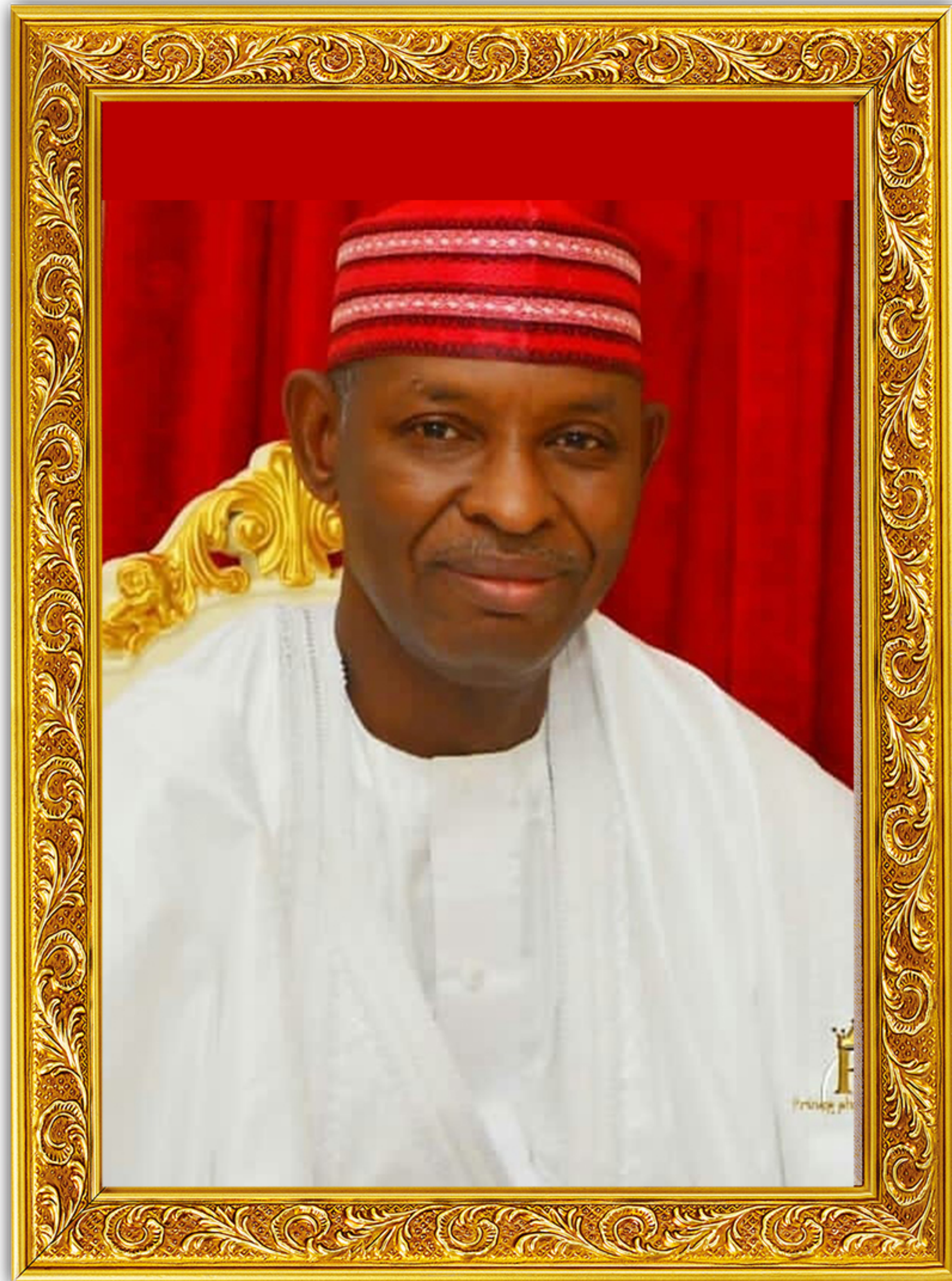
His Excellency Engr. Abba Kabiru Yusuf Executive Governor of Kano