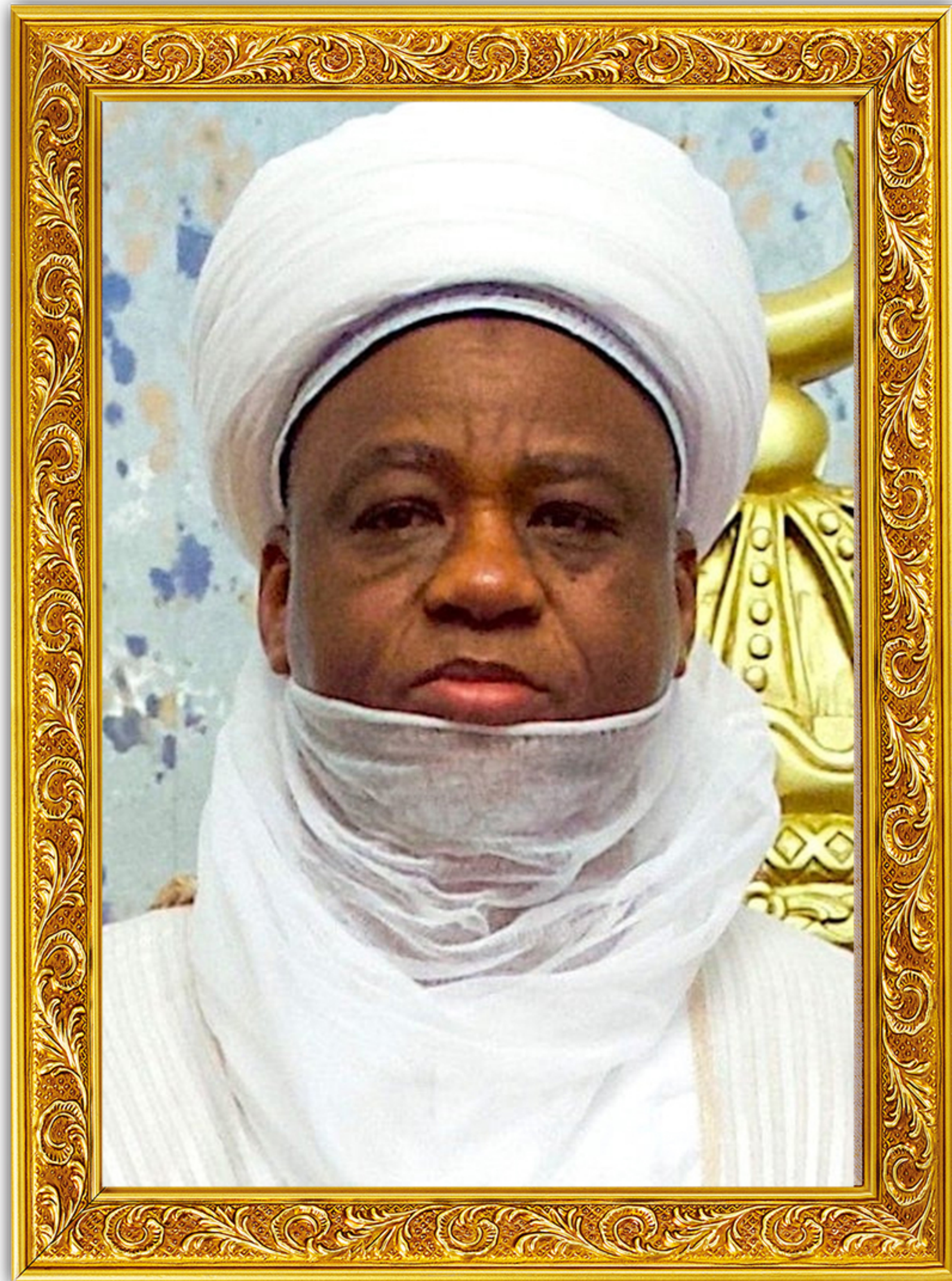
Chairman of the Occasion His Eminence Alh. Muhammad Sa'ad Abubakar, CFR, CNOI, JP The Sultan of Sokoto