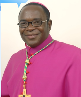
BISHOP MATHIEW HASSAN KUKAH